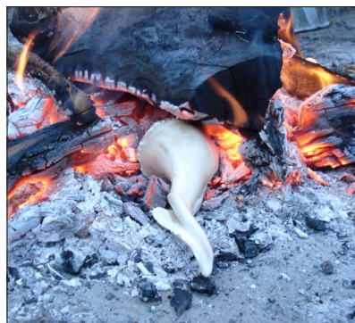
Figure 2. Heating a whelk columella

However, by examining archaeological materials left behind in ancient villages, and experimenting with replicas of the ancient tools, it has been possible to reconstruct this Indigenous technology (Kinsella 2002; Kozuch 2003; Thompson 2008). Recovering this knowledge is important because it documents one specific way that our ancestors applied their