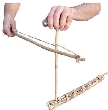
Figure 4. Holding a columella bead in a mulberry branch vice, drilling with a bow drill.

The hardest challenge in making columella beads lies in drilling holes through them so that they can be strung.