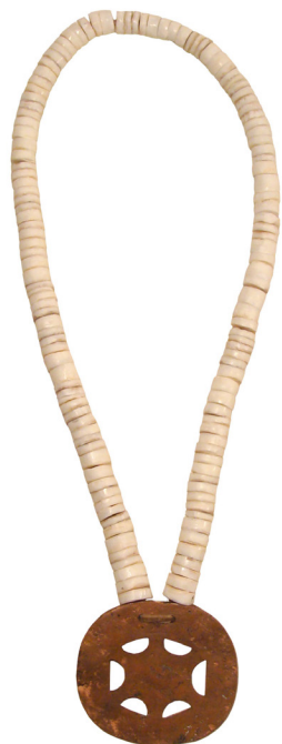
Figure 1. Necklace of whelk shell disk beads with native copper gorget, made by author

One basic and timeless characteristic of human nature is that people like to look good. Observation shows us that, whether back in 10,000 B.C. or today, individuals were and are often willing to go to extraordinary lengths to have a “knockout” appearance. This month’s edition of Iti Fabussa will focus on what was traditionally one of the most important personal accessories for both Choctaw men and women: shell beads.