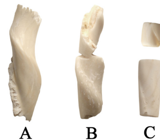
Figure 3. Making bead blanks: (A) columella after chipping; (B) mid-way through cutting bead blanks (C) bead blanks ready for drilling

After the columella cooled, ancient artisans carefully chipped away and remaining edges of the whorl with a sharp-edged stone (Fig. 3-A). Thereafter, the columella was more finely shaped by grinding its edges on sandstone. Then, it was cut into blanks (Fig. 3-B), using a flake of stone dipped in wet sand that was sawn back and forth over the shell. After the columella bead blanks were cut, artisans individually smoothed up each of them by grinding them one at a time on a piece of sandstone (Fig. 3-C).