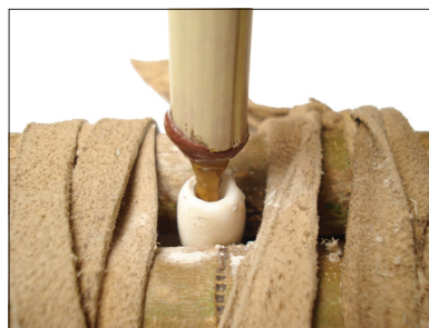
Figure 5, below, shows a close up of the drilling.

The first difficulty to overcome is finding a way to hold the small, round, slippery bead blank so that it can be drilled. An ingeniously simple vice can be made by tightly bending a section of a green mulberry branch in half. The wood splinters at the bend, but the tough bark remains, making a flexible joint. The two sides of the bent branch are pushed together and then bound with leather. Each wrap makes the vice tighter and tighter (Fig. 4).